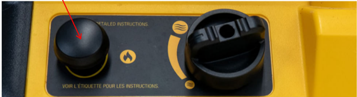
Gas Igniter Valve Button